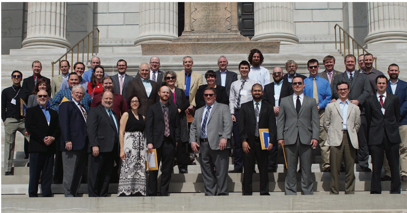
Newly registered professional engineers attending the April 2017 P.E. Certificate Presentation Ceremony marked the special occasion by gathering for a picture with MSPE's member engineer hosts on the Missouri state capitol building steps.