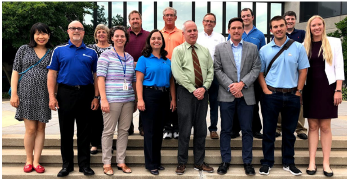
Above Photo: Attendees of the July 9 MSPE meeting at MSD.