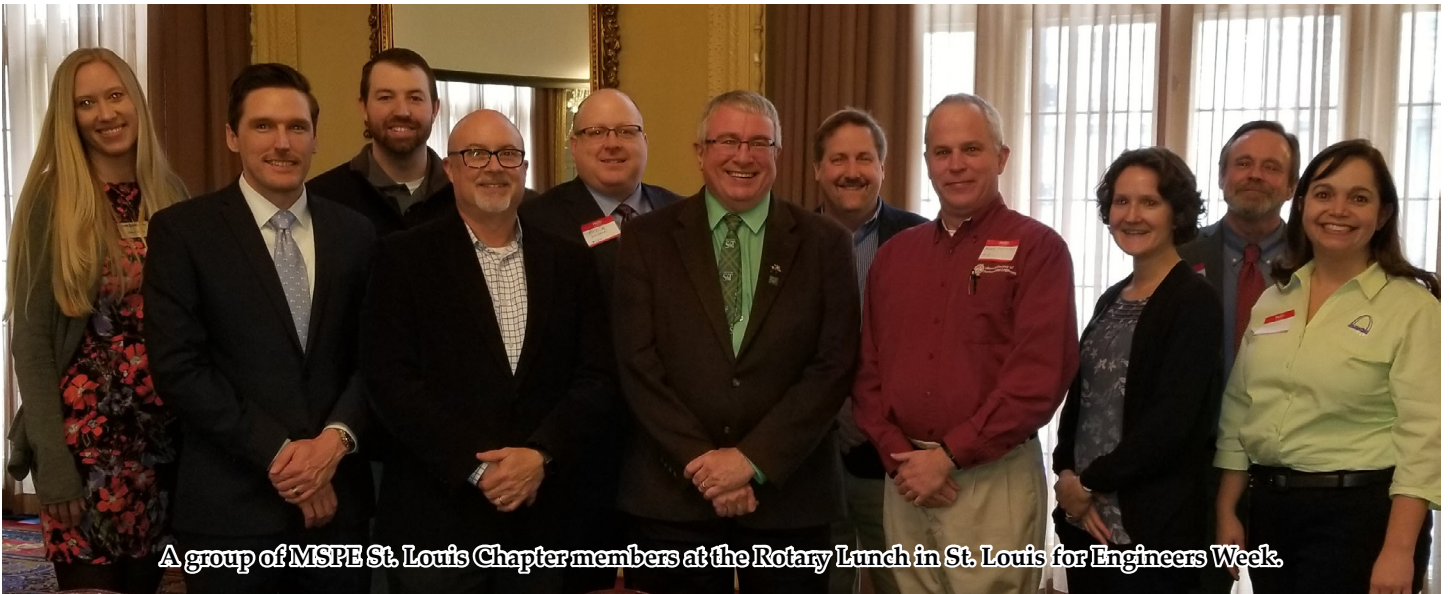
A group of MSPE St. Louis Chapter members at the Rotary Lunch in St. Louis for Engineers Week.