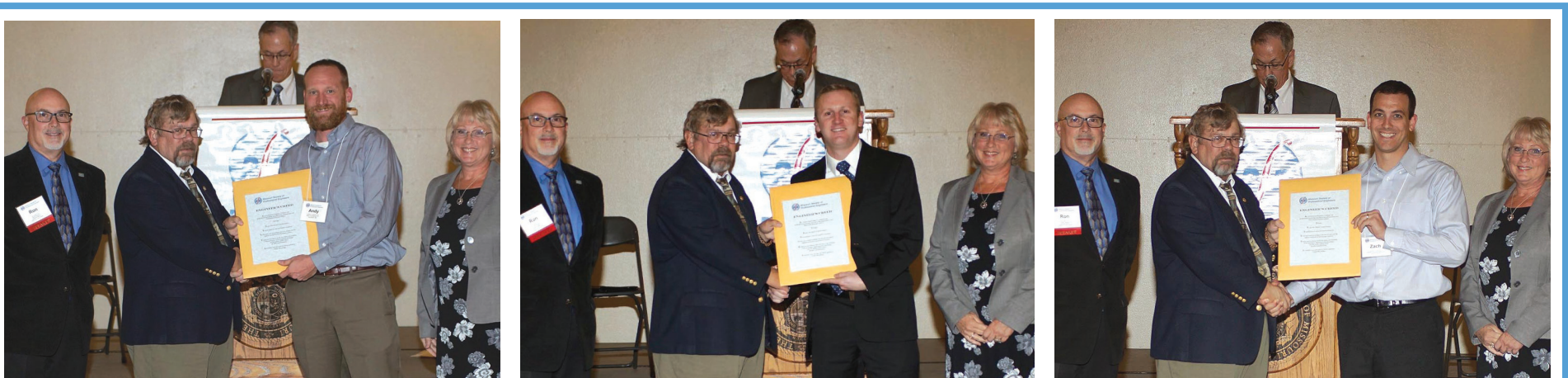
Congratulations, MSPE Newly Registered Professional Engineers

Despite an initial proposal to reduce the size of the architects, engineers, land surveyors and landscape architects registration board to one representative per profession, the task force did follow through on that recommendation.