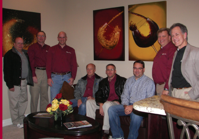
Members of the MSPE Executive Committee and staff had an opportunity to tour The Resort & Yacht Club @ Toad Cove at the Lake of the Ozarks which will be the site of the 2010 and 2011 MSPE Annual Conventions.