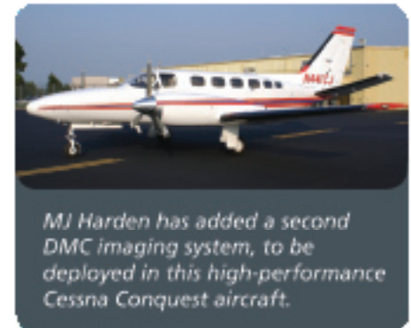
MJ Harden has added a second DMC imaging system, to be deployed in this high-performance Cessna Conquest aircraft.

Since 1956, MJ Harden has been providing geospatial services to engineering firms, government agencies, pipeline companies and utilities. With over 20,000 projects completed, we are known in the industry for quality, performance and reliability.