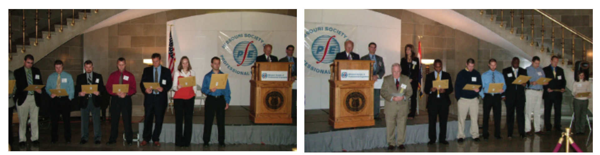
Fourteen newly registered professional engineers recited the Engineers Creed after receiving their certificates in a special presentation ceremony sponsored by the Missouri Society of Professional Engineers at the Capitol Rotunda.