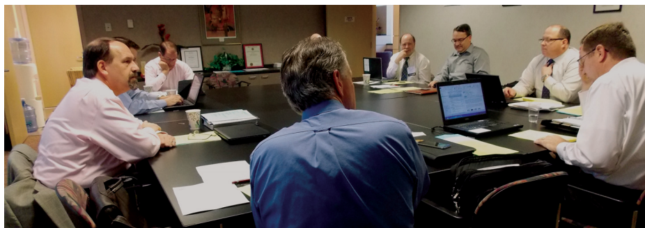
Executive Committee members debate language to amend MSPE's bylaws. It is expected wholesale changes will be introduced in June for approval next year.