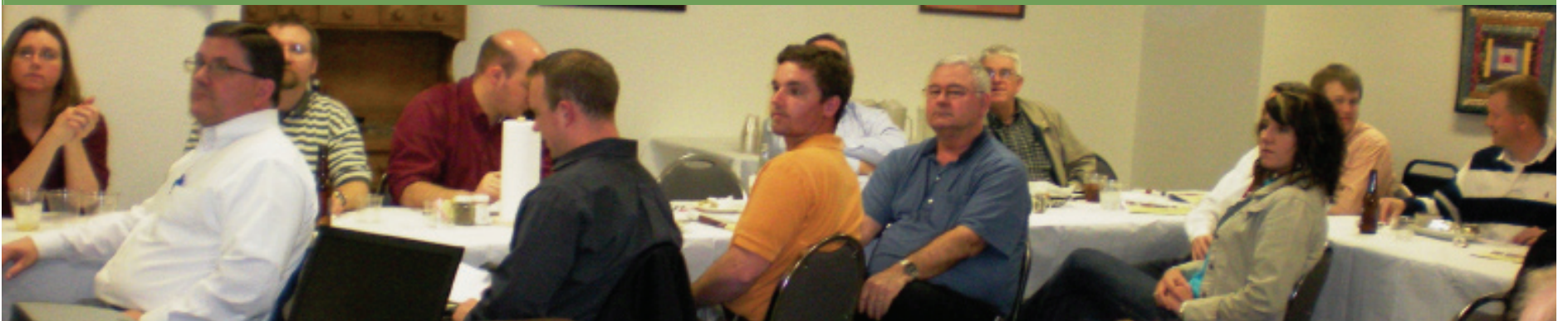
Central and Jefferson City Joint Chapter Meeting