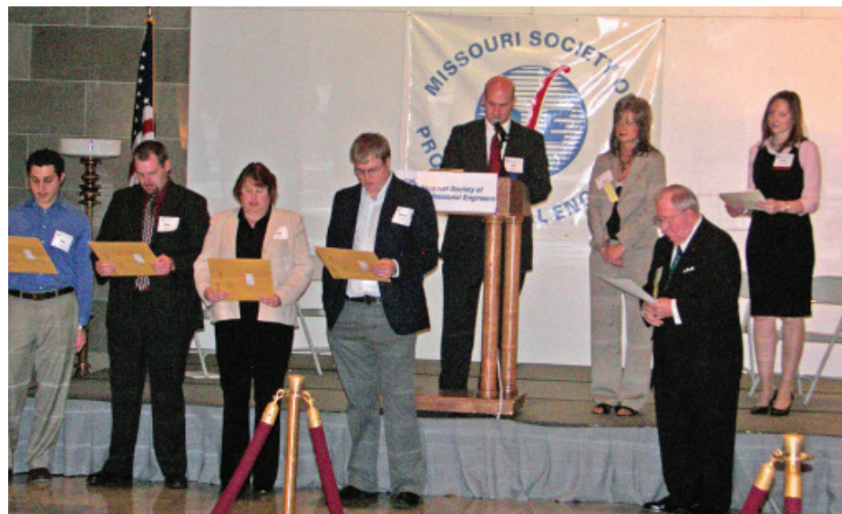
Newly registered professional engineers receive their certificates during the annual spring P.E. Ceremony hosted by MSPE.