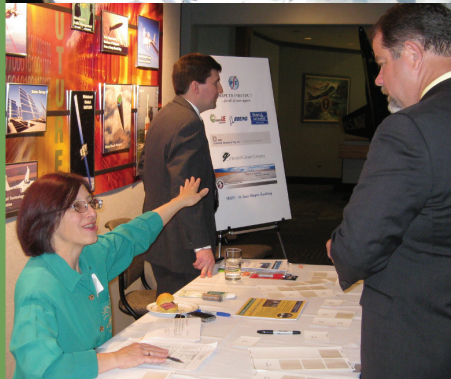
St. Louis Chapter Engineers Week Awards Night