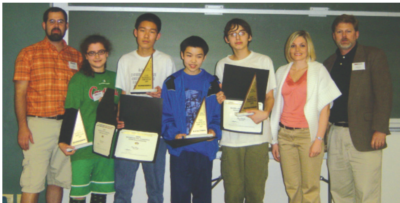
2009 National MATHCOUNTS Team from Missouri

For those not familiar with the event, MATHCOUNTS is the premier nationwide math enrichment, coaching and competition program for middle school students. MATHCOUNTS subjects include algebra, geometry, probability and statistics. Students work as teams and individually. Top students at the