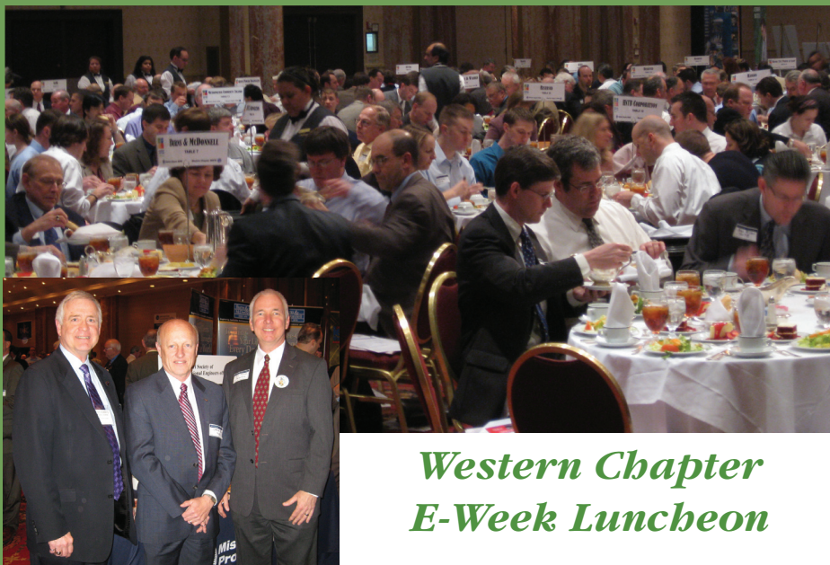
Western Chapter E-Week Luncheon