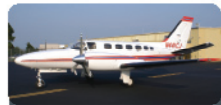
MJ Harden has added a second DMC imaging system, to be deployed in this high-performance Cessna Conquest aircraft.

Since 1956, MJ Harden has been providing geospatial services to engineering firms, government agencies, pipeline companies and utilities. With over 20,000 projects completed, we are known in the industry for quality, performance and reliability.