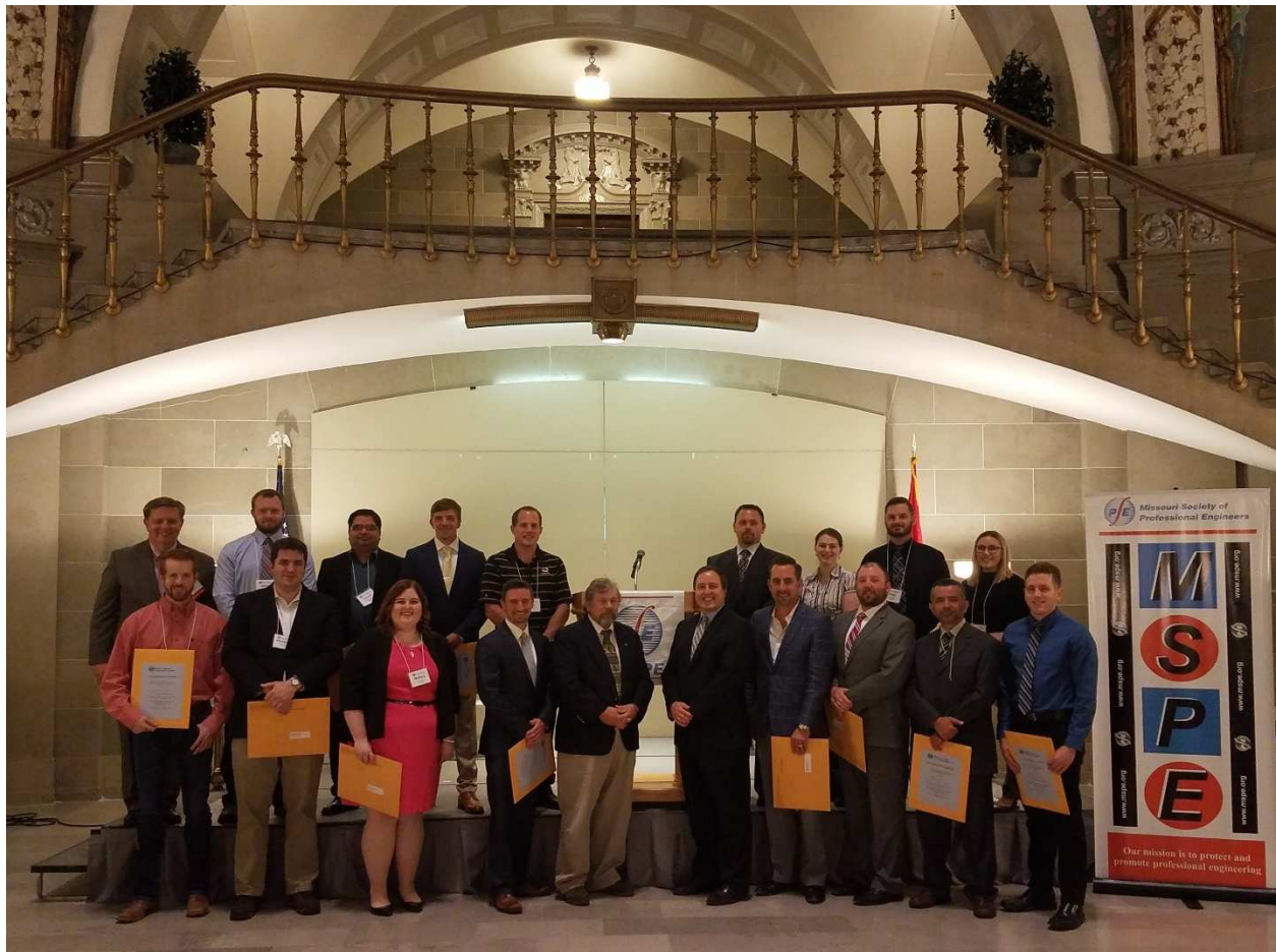
Above Picture: Sixteen new P.E.'s get their license at the MSPE ceremony.