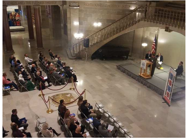
Bottom Row Pictures: One of the speakers for the Ceremony and the new P.E.s and their family and friends listening intently to the speakers at the P.E. ceremony.