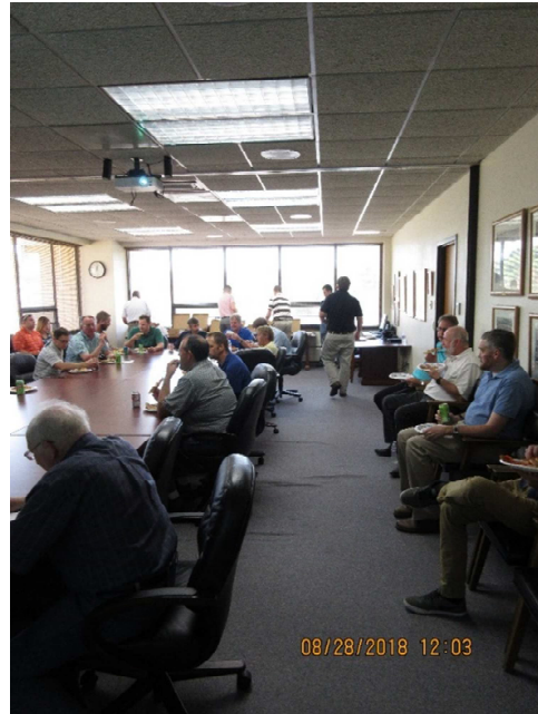
Above Row Pictures: Those in attendance at the meeting enjoying lunch prior to the presentation.