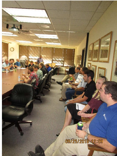
Above Row Pictures: Those in attendance at the meeting enjoying lunch prior to the presentation.